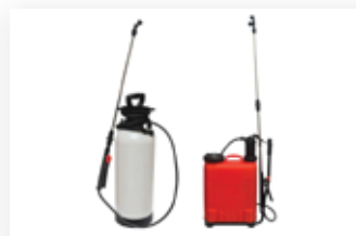
Hand-Held and Backpack Sprayers