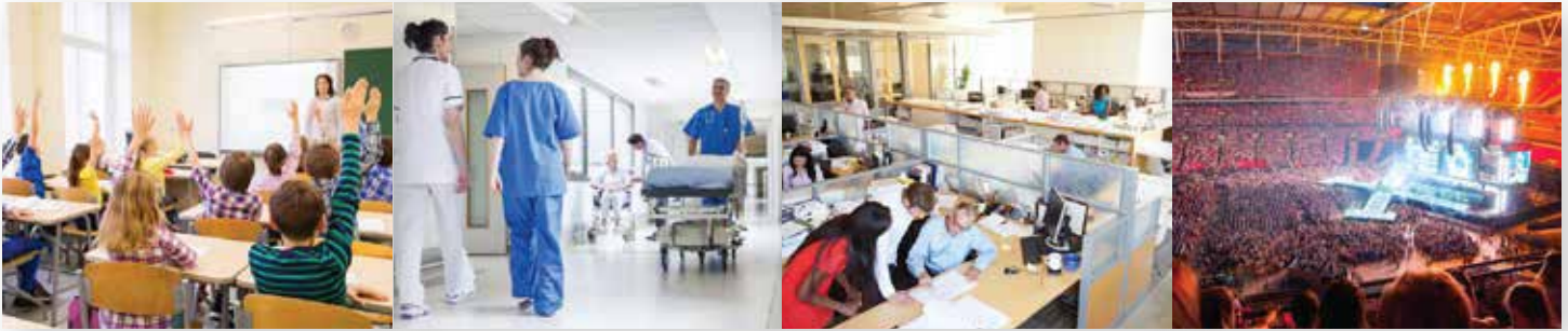
Schools & Colleges