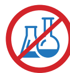
No Harsh Chemicals